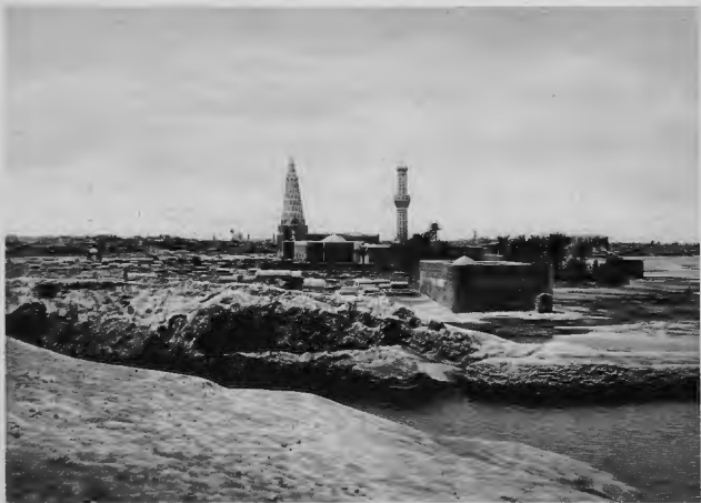
The Shrine of Sheikh Oweis, surrounded by Moslem conebuilds