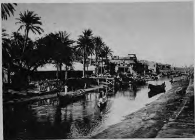
Sohar Creek for Thal el Khalt Baorah