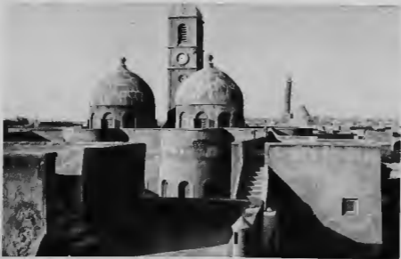
The central mosque of Basul, the 'Djama' of the 'Sultan' of Basul