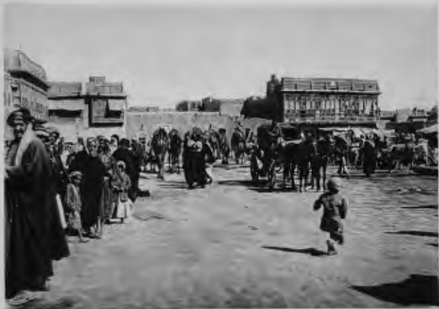
Basrah Square - Basrah City