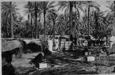
Where the Boxes are packed for export.