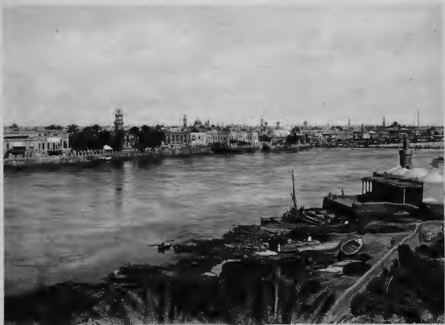
Modern Baghdad the city of Caliph