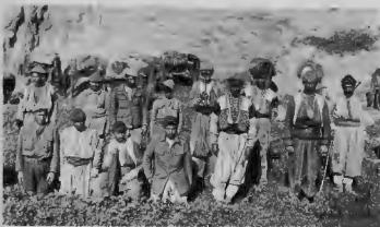
The Group at Fezoua - November 1903