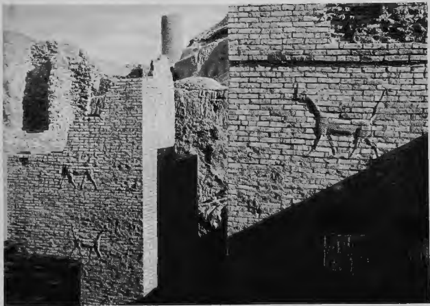
The Ruins of Babylon - The Temple of Marduk