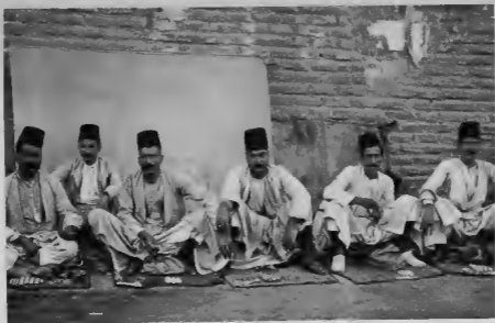
Islamic money changers at Baghdad