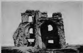
Niqul a portion of the old fortress at Niqul which it have been used as a jail by the Turks centuries ago