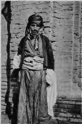
A Kurdish Tribesman of Sulhrom Kiradistan