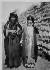
Two Women of the street