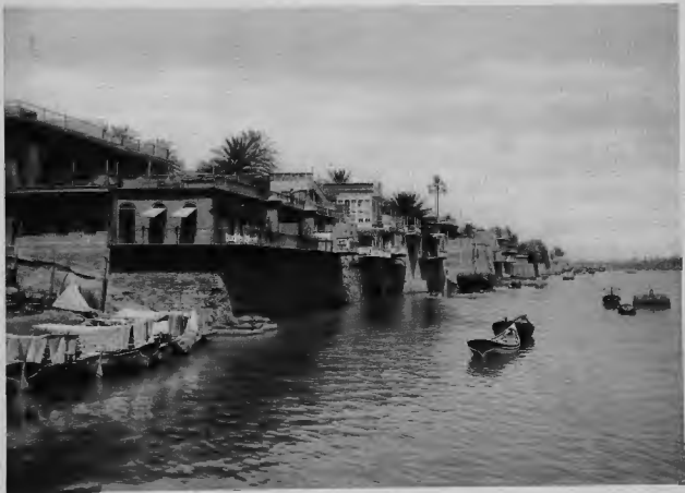
Baghdad & the Tigris