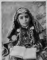
The girl of Gades village near Meoul