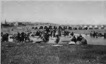
Meoul where the bank of the river is used as a laundry