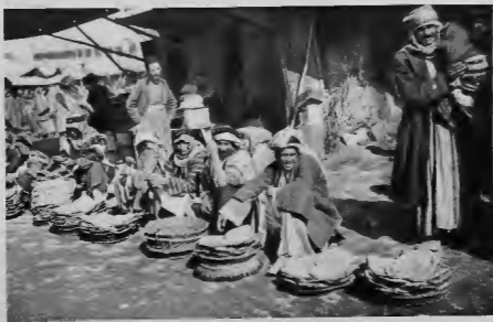
Baghdad, Khubz, a native bread market