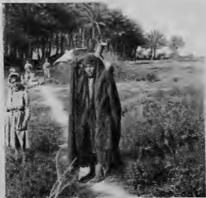
Carrying water direct from the Tigris.