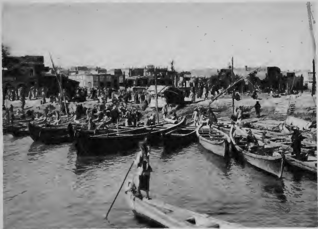
Mojar Beck - Biorak