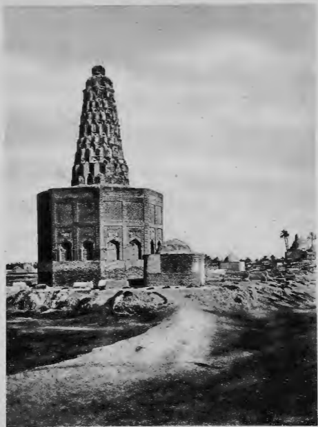
The Tomb of Sultan Mahmud II, Bursa, Turkey. The view of the monument from the south-east side of the city.