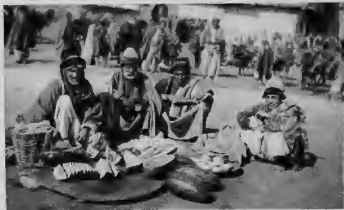
A corner in the bazaar where melons are sold