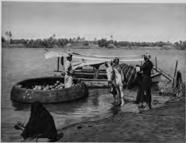
Transport in Iraq