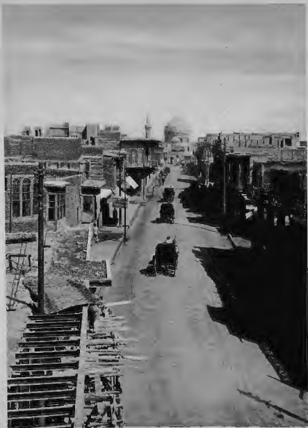
A Street in Birmingham