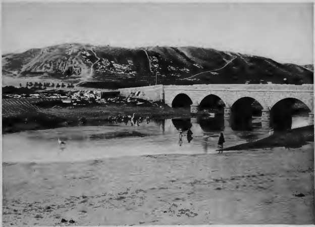
The River of Amara - the left bank of the Tigris, opposite the city of Mosul.