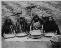
Arab women crushing rice