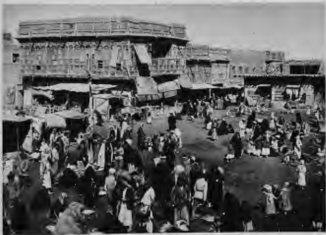
Suq El Djjaj - Raorah Egypt.