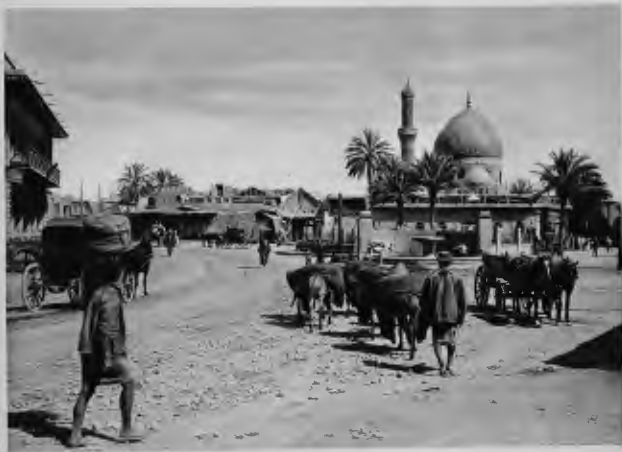
View of New Street Baghdad from North Gate