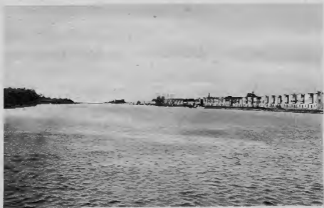
The Pier of Sivas