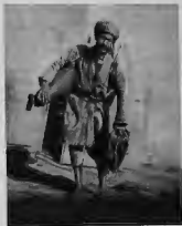
The Turk with his bundle