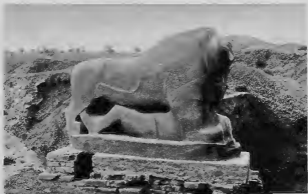
The Lion that for centuries has dominated the Ruins of Babylon.