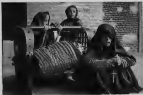
The old-fashioned wheel for the Turk lady