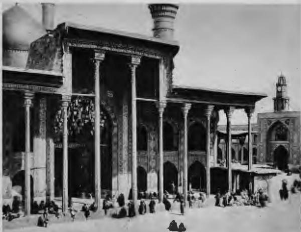
The entrance gate of the Kadimain Mosque leading to the tomb of Imam Musa al-Kadim.