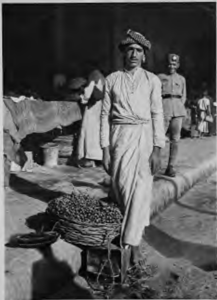
A small trade that brings little gain