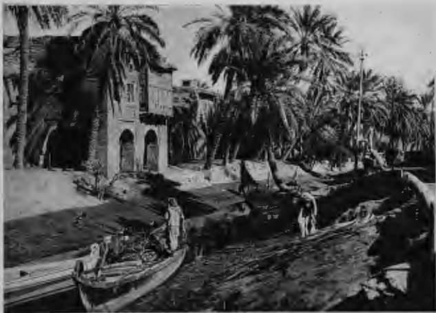
The Canal Creek - Pinarak City