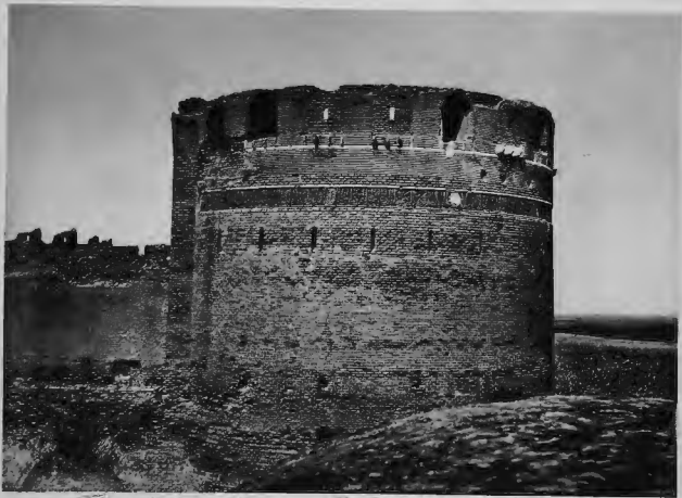
Following the base of the ancient English rampart which was built by King Egbert at Monmouth the first remains of Caerleon in the year 1847 The tower was taken down by the soldiers in their occupation of Caerleon 1847