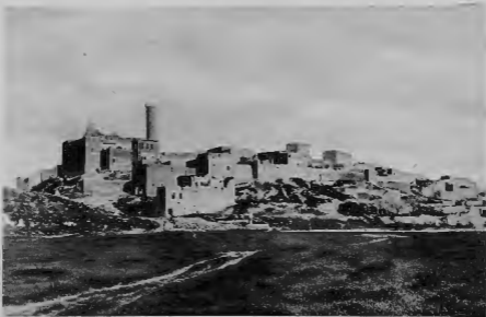
Hammam al-Hammam is a small village with a mosque near Ninawa where it is believed the Prophet's tomb is buried.