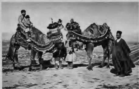
Peopled with their camels on the way to the oasis