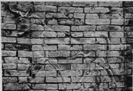
The Gateway of Babylon. An inscription on the Ishtar Gate.