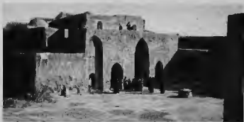
Bar-Bekran a monastery near the tower of Niqul