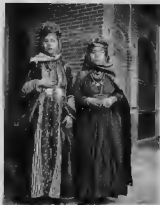
Two Women of Gades village near Meoul