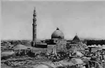
View from the hillside, the mosque of Hammam al-Hammam