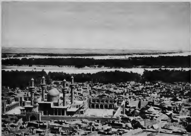
Hadramawt the Holy City near Baghdad from an aeroplane