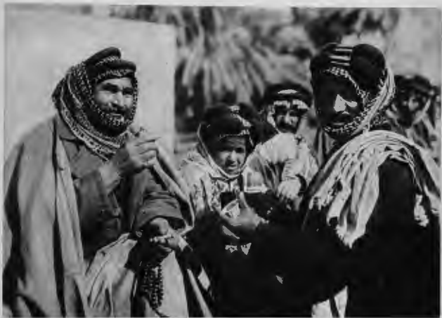
A Sheikh enjoying the famous Arab Coffee