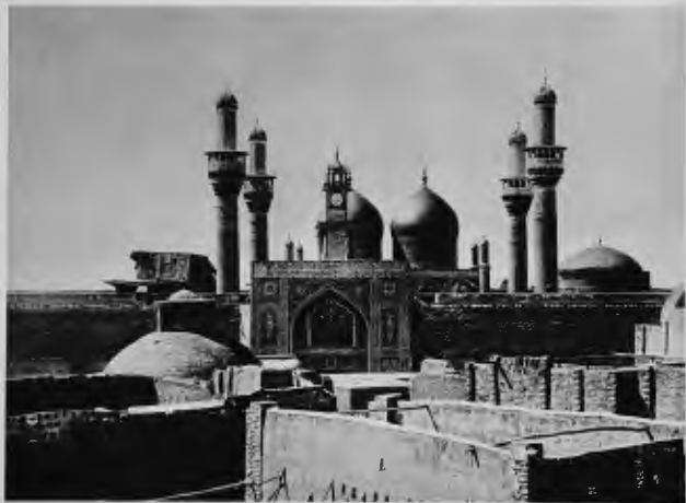
The golden domes and minarets of the Kadmāin Mosque