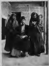
A Jewish family of Baghdad