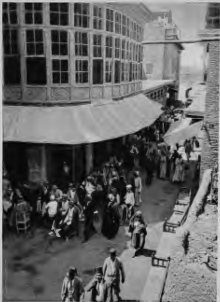
St. Charles, Trinidad