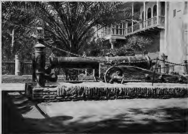
Tut Abu Kharrama a special Turkish Cannon at the Citadel - Baghdad.