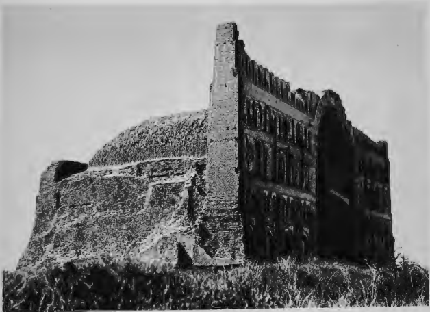
The famous rock of Tezuphom built nearly fifteen centuries ago by the Incas!