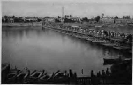
The Humber Bridge, Liverpool