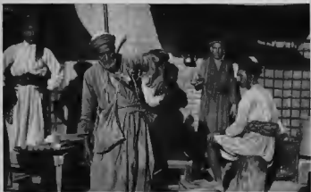
Free distribution of cold drinking water