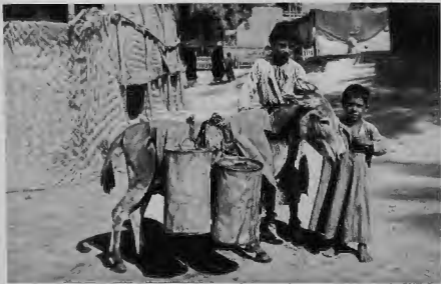
Petrol line supplied shq. gasfaka utilized for evaporating water. to an American refugee camp near Baghdad.