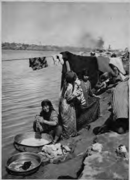
Washers on the bank of the Tigris Baghdad.