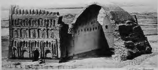
Pyramids as it looks from an aeroplane