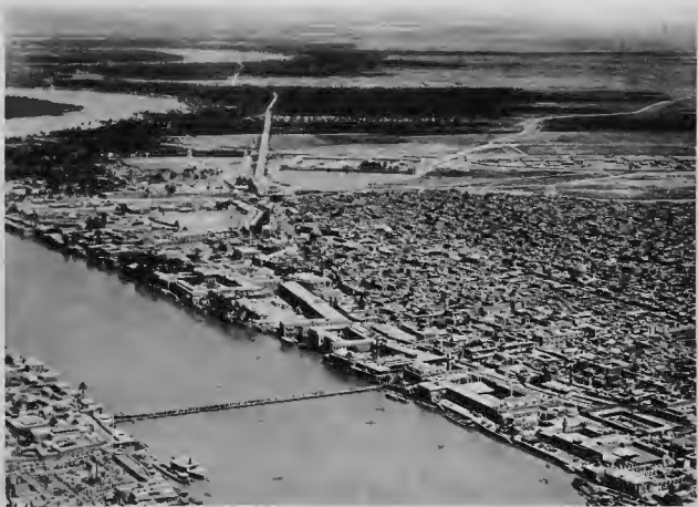
Baghdad from an airplane