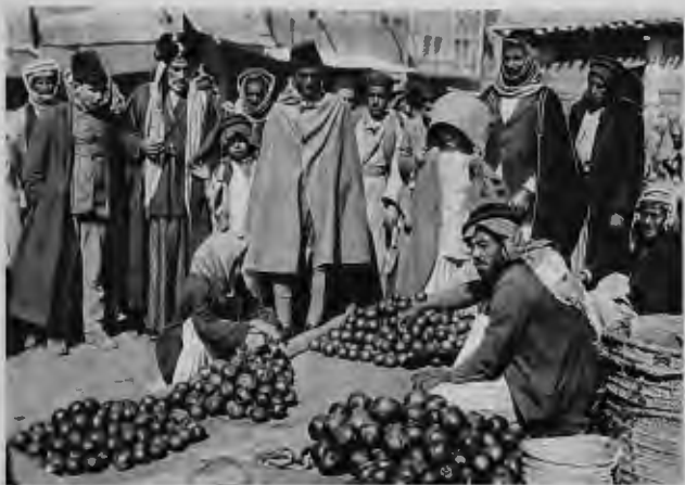
Fruit Market in Baghdad