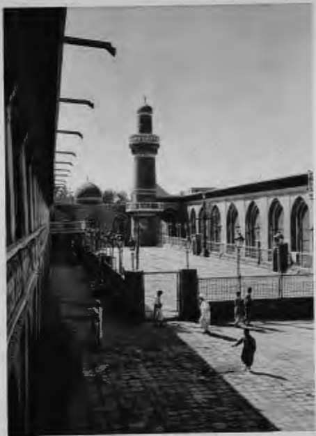
The interior courtyard of the Abdulkader el Taylani Mosque