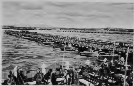
The entrance to Basul at high water during the flood season