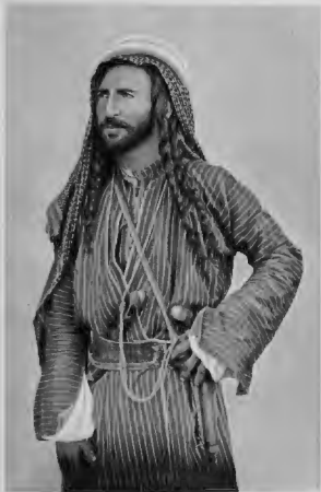
A Bedouin of the desert