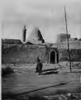
Jami El Ahmar or the Red Mosque at Niqul