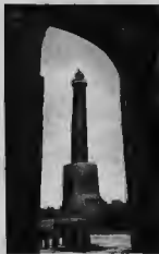
Jami El Sultan is the tower of Niqul and the tallest monument in Niqul