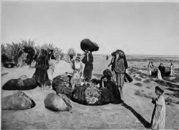
Gathering them for fuel purposes during cold season