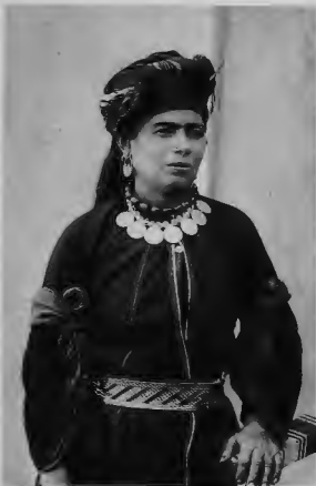
Kurdish Lady in her best costume of black Firooz with silver belt and her necklace of amber beads with Turkish gold ornaments