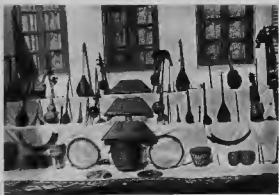
Assorted musical instruments of Iraq