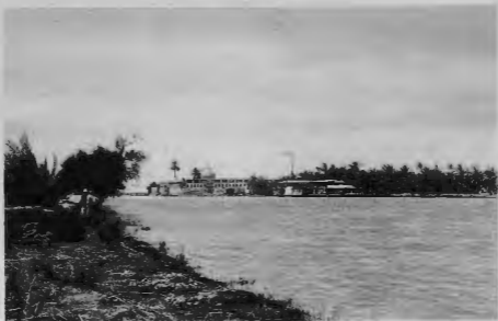
Even's Point on the Tigris