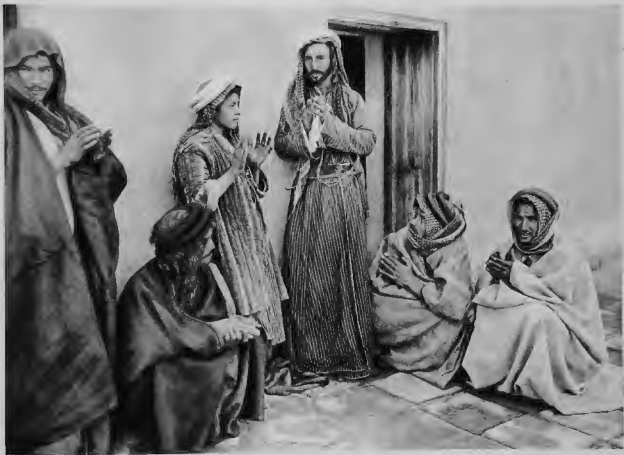
The Mullah teaching a prayer to a young woman.