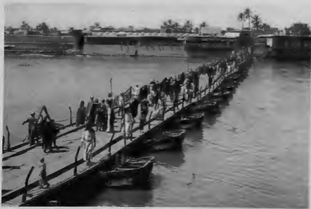
The Humber Bridge, Liverpool