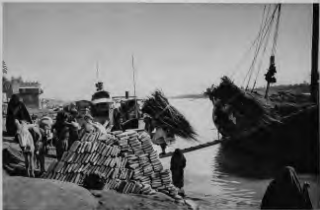
Unloading a Mubaila cargo at Baghdad